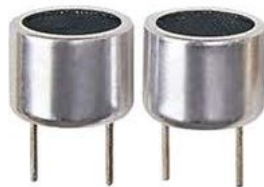
Figure 1: A pair of ultrasound capsules.

The communication channel is based on the ability of air to propagate pressure waves. It is a well-known fact that sound propagates in air (and other materials, such as water, iron, ...) but does not propagate in free space.